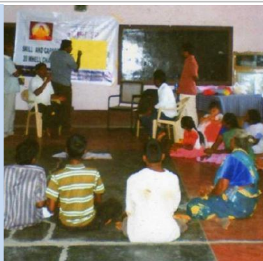
A SWEEAD training event supported by PORT-ER

Last year we supported a different project in India through a grant application from the organization SWEEAD who identified wheelchair users and then delivered job skills training for 20 people.